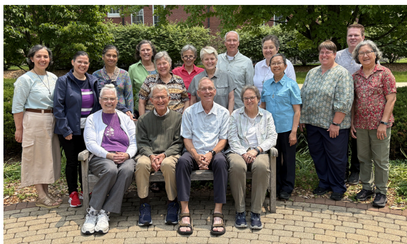
Photo: ForMission Summer 2025 participants and mentors

Guided by their charisms and call to serve the church and world, they embrace formation for mission and inform the work of the Conference.