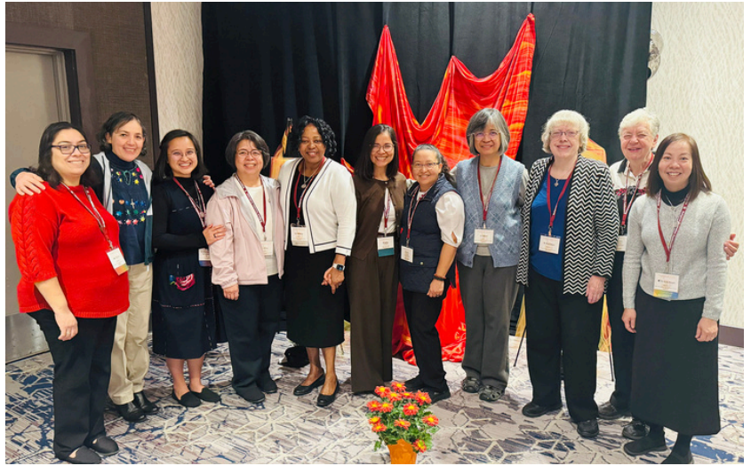
Sisters of Charity of the Incarnate Word (Houston) gathered for a group photo at the 2025 Congress.

Adorers of the Blood of Christ Adrian Dominican Sisters Alexian Brothers The Basilian Fathers of Toronto Benedictine Women of Madison Catholic Theological Union CommonSpirit Health Congregation de Notre Dame Congregation of St. Basil Congregation of the Humility of Mary Congregation of the Oratory Convent of the Sisters of St. Joseph Daughters of Charity Daughters of the Holy Spirit Dominican Sisters of Peace Dominican Sisters of Springfield Felician Sisters of North America Franciscan Sisters of Allegany Franciscan Sisters of the Atonement Glenmary Home Missioners Guest House Holy Union Sisters Little Company of Mary Sisters Liturgical Press Marianist Province of the U.S. Missionary Sisters of the Sacred Heart Morgan Stanley, LLC Mount Sion Community Presentation Sisters Racine Dominican Sisters Saint Luke Institute Saint Meinrad Seminary and School of Theology School Sisters of Notre Dame Atlantic- Midwest Province School Sisters of St. Francis Sinsinawa Dominican Sisters Sisters of Bon Secours Sisters of Charity of Cincinnati Sisters of Charity of the Blessed Virgin Mary