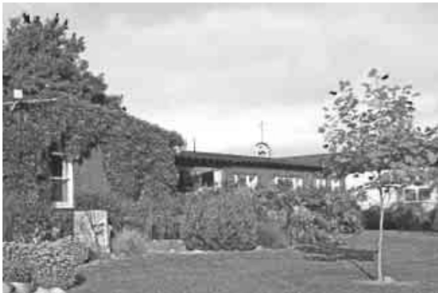
Loyola House, Guelph, Ontario